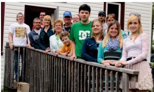
COMMUNITY TURTLE STEWARDS