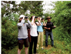
NSNT STAFF & BIRDS EYE VIEW VOLUNTEERS