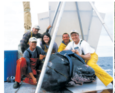
CANADIAN SEA TURTLE NETWORK TEAM