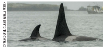
Tall dorsal fin