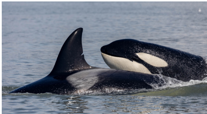
Saddle patch markings

Orcinus orca (Northwest Atlantic / Eastern Arctic Population)