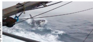
Killer Whale at Brown's Bank